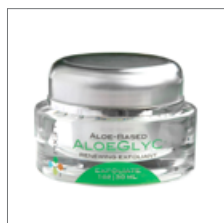
1 oz full size