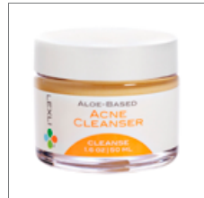
1.6 oz full size