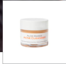
.25 oz travel size

Skin Types Oily, Acne-Prone, Combination