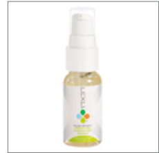
1 oz full size