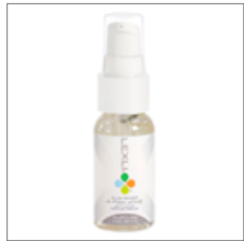
1 oz full size