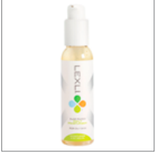
4 oz full size