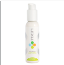
4 oz full size