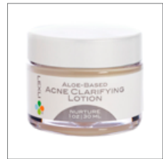
1 oz full size