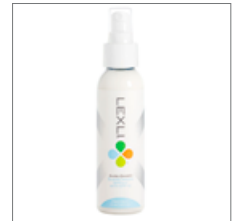
4 oz full size