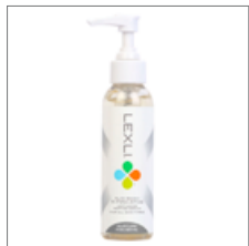
1 oz full size