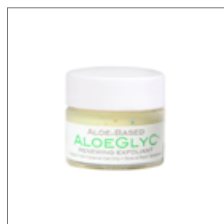
.25 oz travel size

To apply AloeGlyC, place a nickel-sized amount of product in the palm of hand. Using gentle upward and outward strokes, smooth exfoliator onto face and neck. Use caution to keep product out of eyes. DO NOT WASH OFF. Allow AloeGlyC to sit on skin for 10 to 15 minutes before applying the Lexli moisturizer of choice.