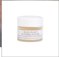
.25 oz travel size