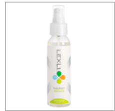
4 oz full size