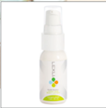
.25 oz travel size