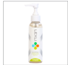
4 oz deluxe size