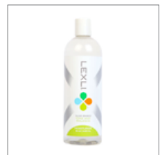
16 oz deluxe size