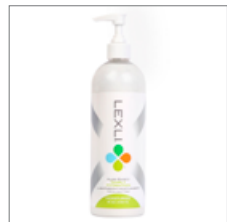
16 oz deluxe size