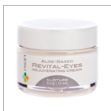
.5 oz full size