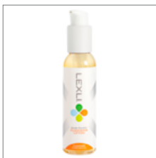
4 oz full size