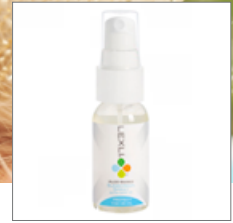
1 oz travel size