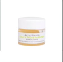
.25 oz travel size

Skin Types Oily, Acne-Prone, Combination