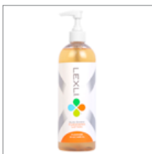
16 oz deluxe size