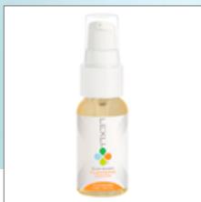
1 oz travel size