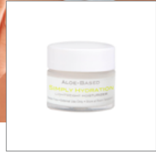
.25 oz travel size

Skin Types Normal, Combination, Dry, Sensitive