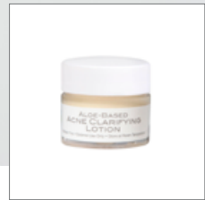
.25 oz travel size

Skin Types Acne-Prone, or as a spot treatment for all skin types