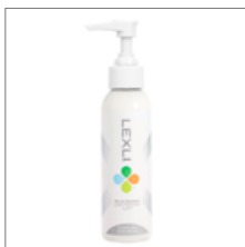
4 oz full size