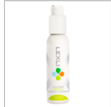
4 oz full size