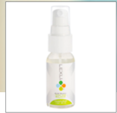
1 oz travel size