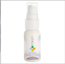
1 oz full size

This product starts with Lexli's signature base of organic, pharmaceutical grade aloe vera, which is noted for its anti-inflammatory properties. To this base we add beneficial ingredients that target the factors involved in facial redness, including Cannabis Sativa Stem (CBD) Oil, which, when used in skin care applications, has been shown to reduce inflammation while offering antioxidant protection to help the skin repair itself. Because a compromised skin barrier and improper hydration are common factors in those with chronic skin redness, Skin Rescue is packed with humectants and emollients, including Hyaluronic Acid and plant oils, to repair barrier function and optimize skin moisture levels. And because sun exposure can worsen inflammation, Skin Rescue includes Zinc Oxide to offer the skin a low level of UV protection.