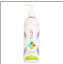
16 oz deluxe size