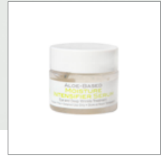
.25 oz travel size